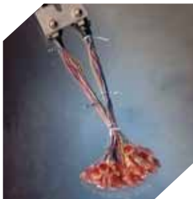
Splice bundle with individual connectors