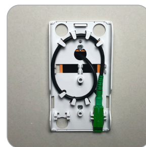
Installs on gang box 125-1827